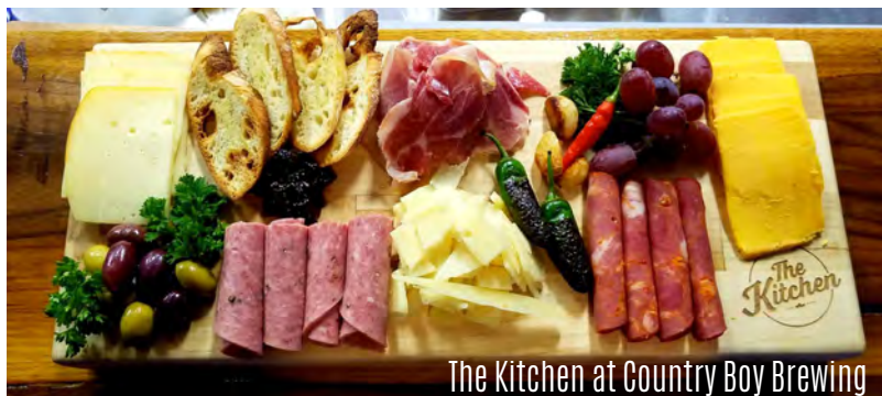
The Kitchen at Country Boy Brewing