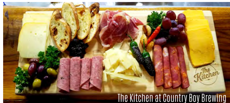
The Kitchen at Country Boy Brewing