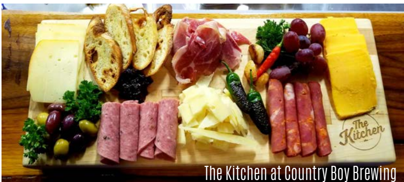
The Kitchen at Country Boy Brewing