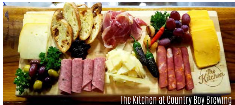
The Kitchen at Country Boy Brewing